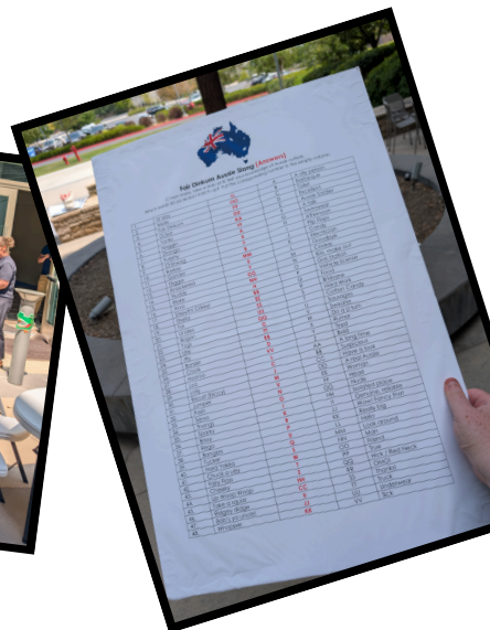
EVENT: AUSSIE LUNCH